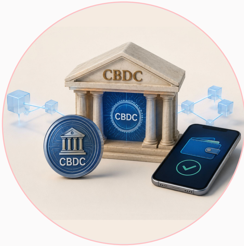
Central Bank Digital Currencies (CBDCs)