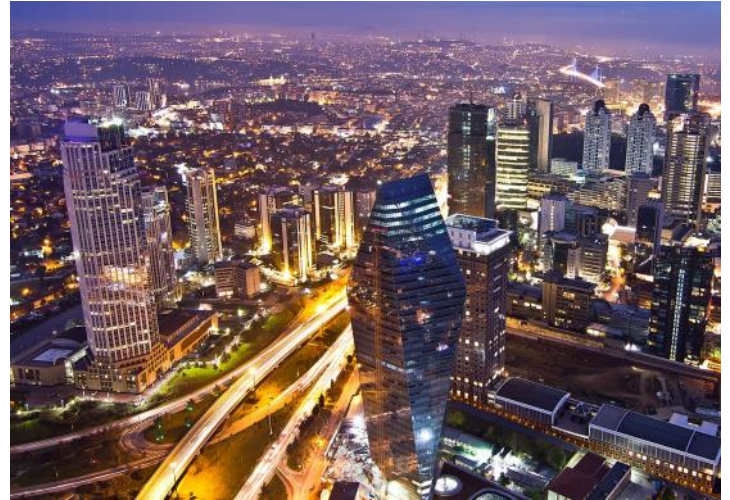
Levent Financial District