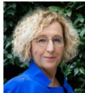
HON. MURIEL PENICAUD Former Minister of Labor; Board Direc- tor, Manpower, Gali- leo Global (France)