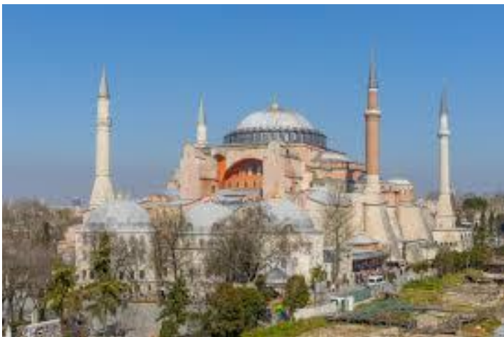
Hagia Sophia Grand Mosque, Istanbul's major cultural and historical site