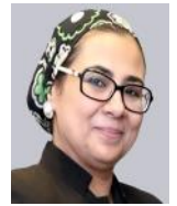
HON. AMAL AMMAR President, National Council of Women Egypt (Egypt)