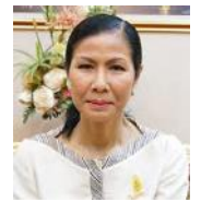
KOBKARN WATTANAVRANGKUL Chair, Toshiba Thailand; Former Minister, Tour- ism and Sports (Thailand)