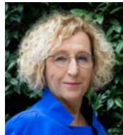
HON. MURIEL PENICAUD Former Minister of Labor; Board Direc- tor, Manpower, Gali- leo Global (France)