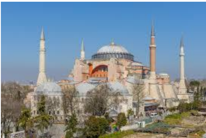
Hagia Sophia Grand Mosque, Istanbul's major cultural and historical site