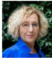
HON. MURIEL PENICAUD Former Minister of Labor; Board Direc- tor, Manpower, Gali- leo Global (France)