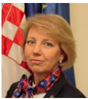
HON. ANDREJA METELKO ZGOMBIC State Secretary for Foreign and European Affairs (Croatia)