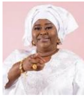
HON. MAIMOUNA DIEYE Minister for Family, Social Action, and Solidarity (Senegal)