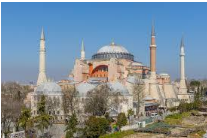
Hagia Sophia Grand Mosque, Istanbul's major cultural and historical site