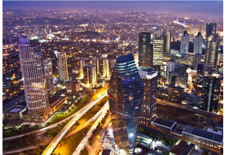
Levent Financial District