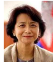
HON. KANTHA PHAVI Minister for Women's Affairs (Cambodia)