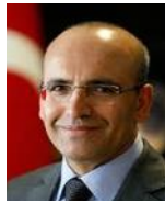
HON. MEHMET SIMSEK Minister for Finance (Turkiye)