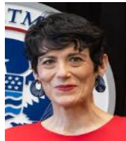
HON. ELMA SAIZ Minister of Inclusion, Social Security and Migration (Spain)