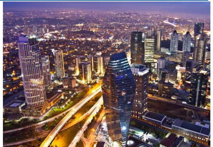
Levent Financial District