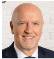
LESZEK WACIRZ CEO, Nestle Turkiye (Poland)