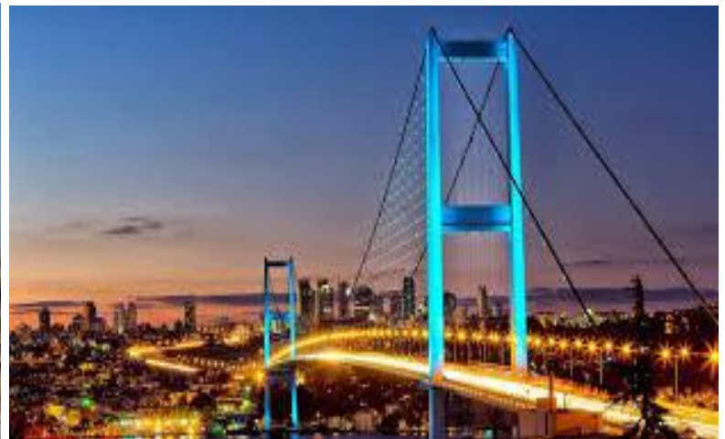
Bridges across Bosphorus River connecting Europe to Asia