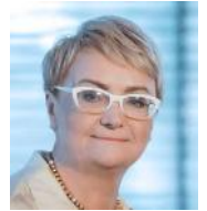
HENRYKA BOCHNIARZ Chair, Polish Confederation of Private Employers; Former Minister of Trade (Poland)