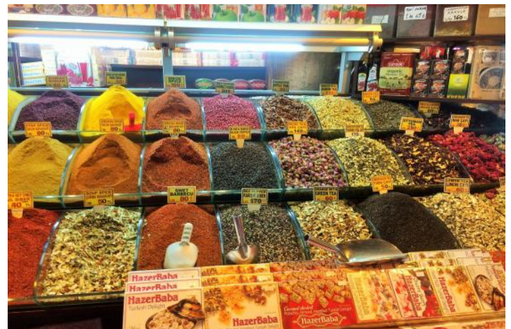
Spice Market in the Grand Bazaar