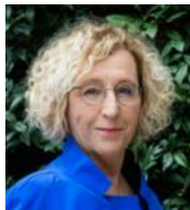
HON. MURIEL PENICAUD Former Minister of Labor; Board Direc- tor, Manpower, Gal- ileo Global (France)