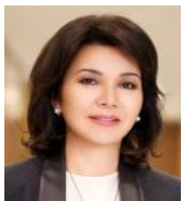
UMUT SHAYAKHMATOVA CEO, Halyk Bank (Kazakhstan)