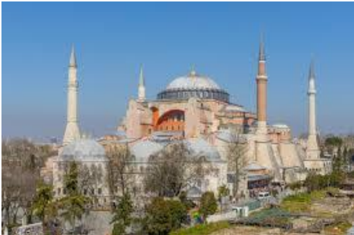
Hagia Sophia Grand Mosque, Istanbul's major cultural and historical site