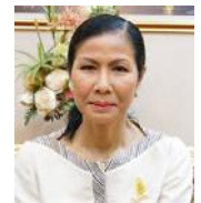
KOBKARN WATTANAVRANGKUL Chair, Toshiba Thailand; Former Minister, Tour- ism and Sports (Thailand)