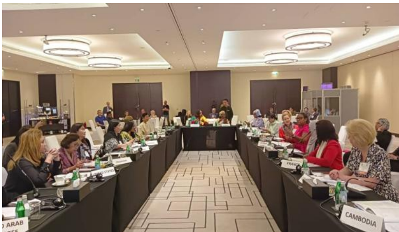
Ministers at 2023 Roundtable in Dubai .