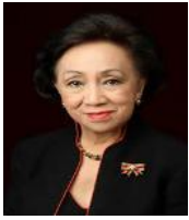
HON. DELIA DOMINGO-ALBERT Former Secretary of Foreign Affairs (Philippines)