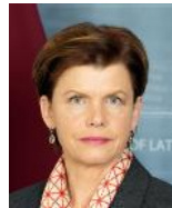
HON. BAIBA BRAZE Minister of Foreign Affairs (Latvia)