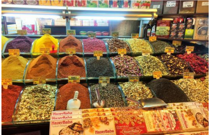
Spice Market in the Grand Bazaar