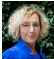
HON. MURIEL PENICAUD Former Minister of Labor; Board Direc- tor, Manpower, Gali- leo Global (France)