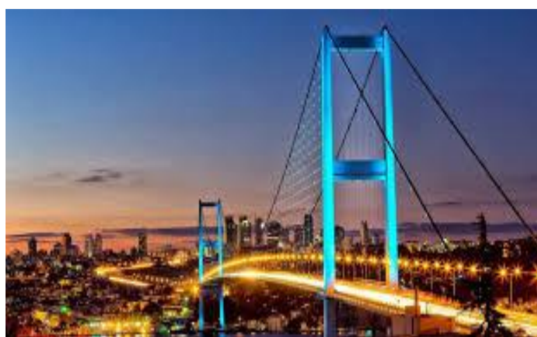
Bridges across Bosphorus River connecting Europe to Asia