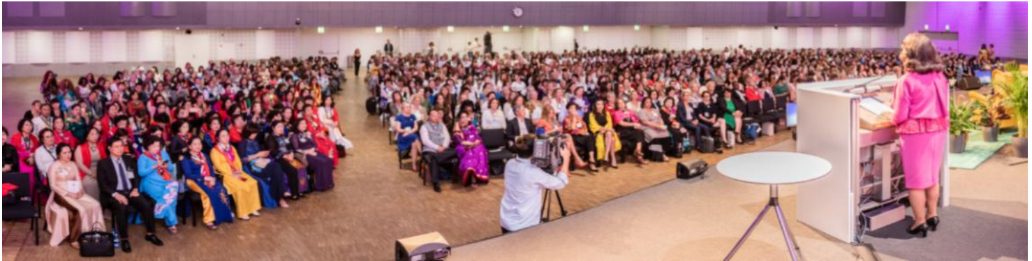
2019 Summit in Basel, Switzerland

WOMEN: BUILDING BRIDGES TO A BOLD TOMORROW