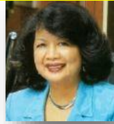
IRENE NATIVIDAD President, Global Summit of Women (USA)