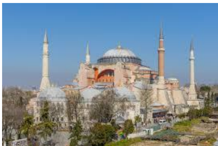
Hagia Sophia Grand Mosque, Istanbul's major cultural and historical site