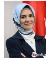
HON. MAHINUR OZDEMIR GOKTAS Minister for Family and Social Services (Turkiye)