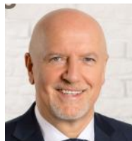
LESZEK WACIRZ CEO, Nestle Turkiye (Poland)