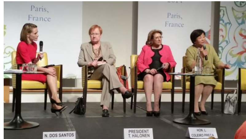
Presidents of Finland, Malta, Kyrgyzstan at the 2014 Summit in Paris.