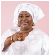
HON. MAIMOUNA DIEYE Minister for Family, Social Action, and Solidarity (Senegal)