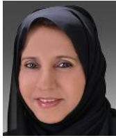
HON. DR. MAITHA ALSHAMSI Minister of State (UAE)