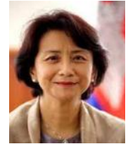
HON. KANTHA PHAVI Minister for Women's Affairs (Cambodia)