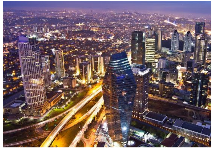
Levent Financial District