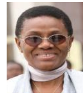
HON. MARIE-THERESE ABENA ONDOA Minister for Women's Empowerment (Cameroon)