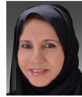
HON. DR. MAITHA AL- SHAMSI Minister of State (UAE)