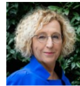
HON. MURIEL PENICAUD Former Minister of Labor; Board Director, Manpower, Galileo Global (France)