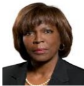
ERTHARIN COUSIN Supervisory Board Director, Bayer AG (USA)