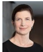
BETTINA ORLOPP CEO, Commerzbank (Germany)