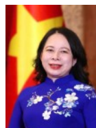
HON. VO THI ANH XUAN Vice President, Vietnam