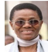
HON. MARIE-THERESE ABENA ONDOA Minister for Women's Empowerment (Cameroon)