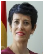
HON. ELMA SAIZ Minister for Inclusion, Social Security, Migra- tion (Spain)