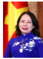
HON. VO THI ANH XUAN Vice President, Vietnam