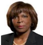
ERTHARIN COUSIN Supervisory Board Director, Bayer AG (USA)