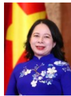
HON. VO THI ANH XUAN Vice President, Vietnam