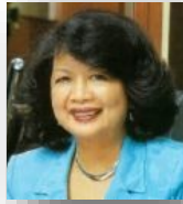
IRENE NATIVIDAD President, Global Summit of Women (USA)