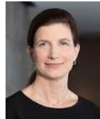
BETTINA ORLOPP CEO, Commerzbank (Germany)