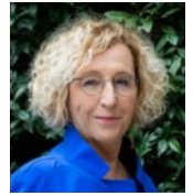
HON. MURIEL PENICAUD Former Minister of Labor; Board Director, Manpower, Galileo Global (France)