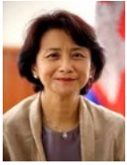
HON. KANTHA PHAVI Minister for Women's Affairs (Cambodia)