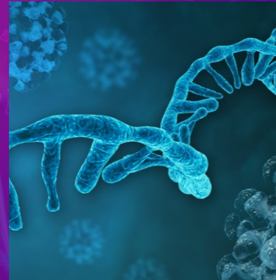
Virtual mRNA Laboratories Technology