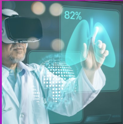
Medical Training Simulations