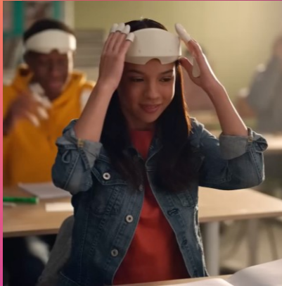
Virtual Field Trips