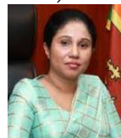
HON. SEETHA ARAMBEPOLA Minister for Health (Sri Lanka)