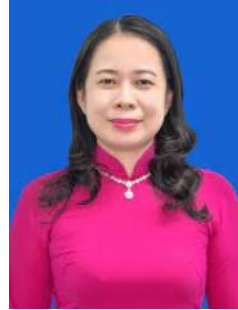
H.E. VO THI ANH XUAN Acting President, Vietnam