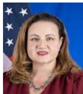
KATRINA FOTOVAT Senior Official, Office of Global Women's Issues (USA)