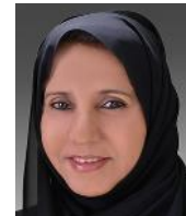
H.E. DR. MAITHA AL-SHAMSI Minister of State (UAE)