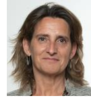
HON. TERESA RIBERA 3rd Vice President and Minister for Ecological Transition (Spain)