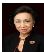
HON. DELIA DOMINGO-ALBERT Former Sec. of Foreign Affairs (Philippines)