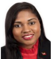
HON. MARIA VANESSA BROWNE Minister for Housing and Urban Renewal (Antigua and Barbuda)