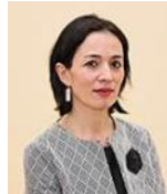
HON. ZHANNA ANDREASYAN Minister for Education, Culture and Sport (Armenia)