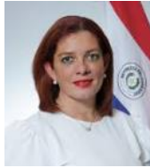
HON. CYNTHIA FIGUEREDO Minister for Women (Paraguay)