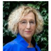
MURIEL PENICAUD Former Minister of Labor; Board Director, Manpower Group, Galileo Global (France)