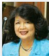
IRENE NATIVIDAD President, Global Summit of Women (USA)