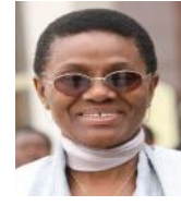
HON. MARIE-THERESE ABENA ONDOA Minister for Women's Empowerment (Cameroon)