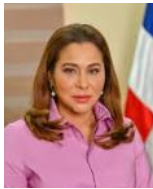
HON. MAYRA JIMENEZ Minister for Women (Dominican Republic)