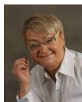
HENRYKA BOCHNIARZ Former Minister for Trade (Poland)