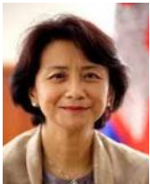
HON. KANTHA PHAVI Minister for Women's Affairs (Cambodia)