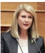
HON. SOFIA VOULTEPSI Deputy Minister for Migration (Greece)