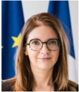
HON. AURORE BERGE Minister for Gender Equality (France)