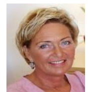
JONINA BJARTMARZ Former Minister for Environment (Iceland)