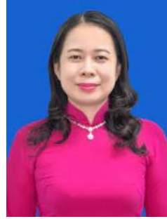
H.E. VO THI ANH XUAN Acting President, Vietnam