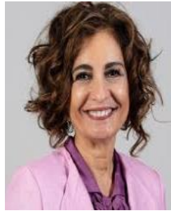
H.E. MARIA JESUS MONTERO 1st Vice President, Spain