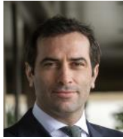
HON. CARLOS CUERPO Minister for Economy, Spain