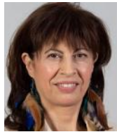
HON. ANA REDONDO GARCIA Minister for Equality (Spain)