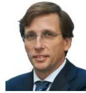
HON. JOSE LUIS MARTINEZ-ALMEIDA Mayor of Madrid