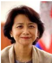
HON. KANTHA PHAVI Minister for Women's Affairs (Cambodia)