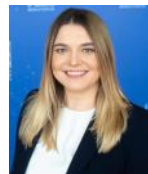
HON. IEVA VALESKAITE Deputy Minister for the Economy and Innova- tion (Lithuania)