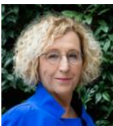
MURIEL PENICAUD Former Minister of Labor; Board Director, Manpower Group, Galileo Global (France)