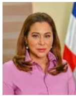
HON. MAYRA JIMENEZ Minister for Women (Dominican Republic)