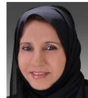
H.E. DR. MAITHA AL-SHAMS Minister of State (UAE)