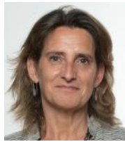
HON. TERESA RIBERA Third Deputy Prime Min- ister and Minister for Ecological Transition (Spain)