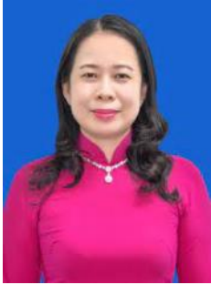
H.E. VO THI ANH XUAN Vice President, Vietnam