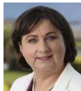
HON. ANNE RABBITTE Minister for Disability (Ireland)