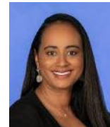
HON. TINEE FURBERT Minister for Youth, So- cial Development and Seniors (Bermuda)