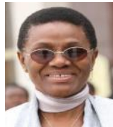
HON. MARIE-THERESE ABENA ONDOA Minister for Women's Empowerment (Cameroon)