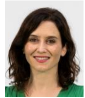
HON. ISABEL DIAZ AYUSO President, Community of Madrid