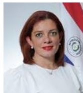
HON. CYNTHIA FIGUEREDO Minister for Women (Paraguay)