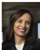
BEATRIZ CORREDOR Chairwoman, REDEIA (Spain)