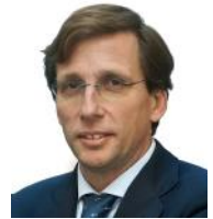
HON. JOSE LUIS MARTINEZ-ALMEIDA Mayor of Madrid