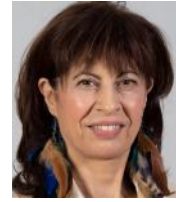
HON. ANA REDONDO GARCIA Minister for Equality (Spain)