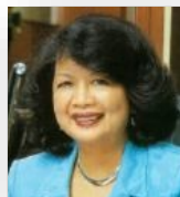
IRENE NATIVIDAD President, Global Summit of Women (USA)