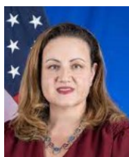
KATRINA FOTOVAT Senior Official, Office of Global Women's Issues (USA)