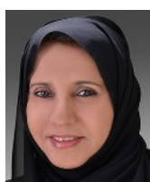
H.E. DR. MAITHA AL-SHAMS Minister of State (UAE)