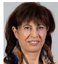
HON. ANA REDONDO GARCIA Minister for Equality (Spain)