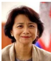
HON. KANTHA PHAVI Minister for Women's Affairs (Cambodia)