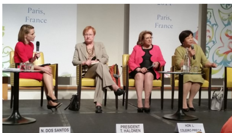
Tarja Halonen, former President of Finland; Marie-Louise Coleiro Preca, President of Malta; and Roza Otunbayeva, former President of Kyrgyzstan at the 2015 Summit in Paris.