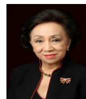
HON. DELIA DOMINGO-ALBERT Former Secretary of Foreign Affairs (Philippines)