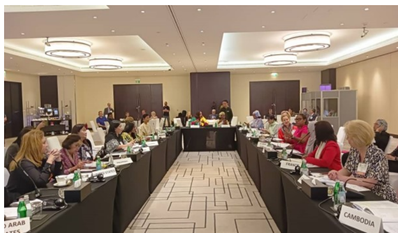
Ministers at 2023 Summit in Dubai share public-private sector partnerships for increasing women and girls economic opportunities.