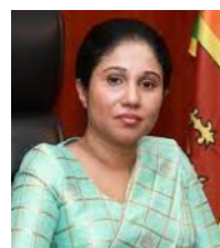
HON. SEETHA ARAMBEPOLA Minister for Health (Sri Lanka)