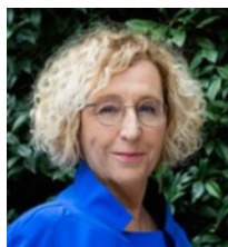
MURIEL PENICAUD Former Minister of Labor, France; Board Director, Manpower Group, Galileo Global (France)