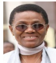
HON. MARIE-THERESE ABENA ONDOA Minister for Women's Empowerment (Cameroon)