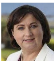
HON. ANNE RABBITTE Minister for Disability (Ireland)