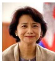
HON. ING. KANTHA PHAVI Minister for Women's Affairs (Cambodia)