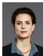
NORA TEUWSEN CEO, ABB Switzerland (Switzerland)