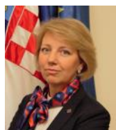
HON. ANDREJA METELKO-ZGOMBIC State Secretary for Foreign Affairs (Croatia)