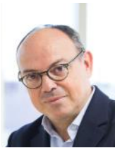
LEOPOLDO BOADO Regional Head, Oracle Applications for Middle East, Africa, Eastern Europe and CIS, Oracle (Spain)