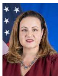
KATRINA FOTOVAT Acting Ambassador for Global Women's Issues (USA)