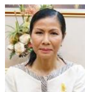
KOBKARN WATTANAVRANGKUL Former Minister of Tourism and Sports; Chair, Toshiba Thailand (Thailand)