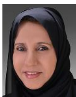
H.E. DR. MAITHA AL-SHAMSI Minister of State (UAE)