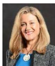
AMANDA ELLIS Former Undersecre- tary for International Development (New Zealand)