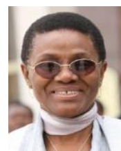
HON. MARIE-THERESE ABENA ONDOA Minister for Women's Empowerment (Cameroon)