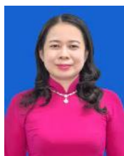
H.E. VO THI ANH XUAN Vice President, Vietnam