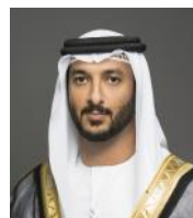
H.E. ABDULLA BIN TOUQ AL MARRI Minister of Economy (UAE)