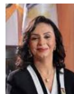
HON. MAYA MORSI President, National Council of Women Egypt (Egypt)