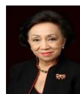
HON. DELIA DOMINGO- ALBERT Former Secretary of For- eign Affairs (Philippines)