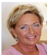
JONINA BJARTMARZ Former Minister for Environment (Iceland)