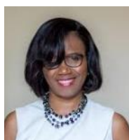
ELISABETH MORENO Former Minister for Gender Equality, Di- versity and Equal Op- portunities (France)