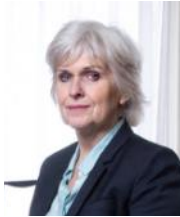
HON. ISABELLE ROME Minister for Gender Equality, Diversity and Equal Opportunities (France)