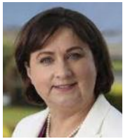
HON. ANNE RABBITTE Minister for Disability (Ireland)