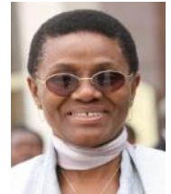
HON. MARIE-THERESE ABENA ONDOA Minister for Women's Empowerment (Cameroon)