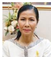
KOBKARN WATTANAVRANGKUL Former Minister of Tourism and Sports; Chair, Toshiba Thailand (Thailand)