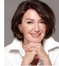
HON. ATIFETE JAHJAGA Former President, Kosovo