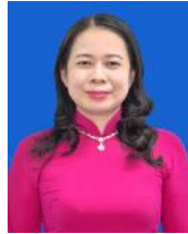
H.E. VO THI ANH XUAN Acting President, Vietnam