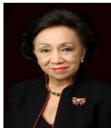
HON. DELIA DOMINGO-ALBERT Former Secretary of Foreign Affairs (Philippines)