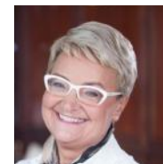
HENRYKA BOCHNIARZ Former Minister of Trade; Chair, Polish Private Employers Confederation (Poland)