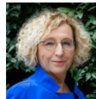
MURIEL PENICAUD Former Minister of Labor and Ambassador to OECD (France)