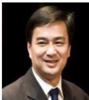
HON. ABHISIT VEJJAJIVA Former Prime Minister (Thailand)