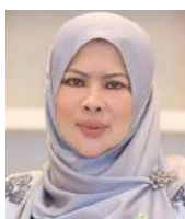
HON. DATUK RINA HARUN Minister of Women, Family, and Community Development (Malaysia)