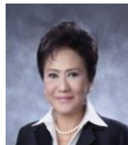
HON. KHUNYING KA- LAYA SOPHONPANICH Deputy Minister of Education (Thailand)