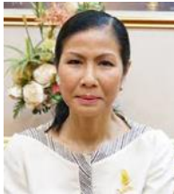
KOBKARN WATTANAVRANGKUL Chair, Toshiba Thailand; Former Minister of Tourism and Sports (Thailand)