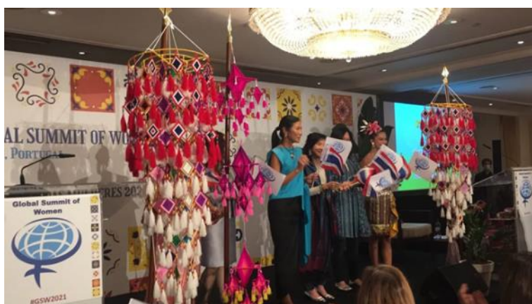
Thai delegates at the 2021 Summit in Portugal