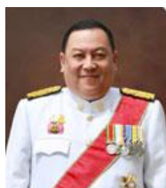
HON. JUTI KRAIRIKSH Minister for Social De- velopment and Human Security (Thailand)