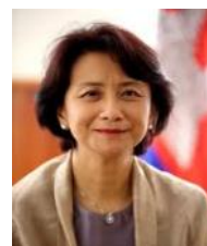
HON. KANTHA PHAVI Minister for Women's Affairs (Cambodia)