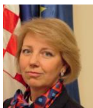
HON. ANDREJA METELKO-ZGOMBIC State Secretary for Foreign Affairs (Croatia)