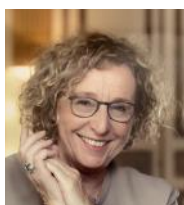
HON. MURIEL PENICAUD Former Minister of Labor (France)