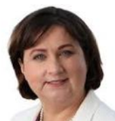
HON. ANNE RABBITTE Minister for Disabilities (Ireland)