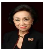
HON. DELIA DOMINGO- ALBERT Former Secretary of Foreign Affairs (Philippines)