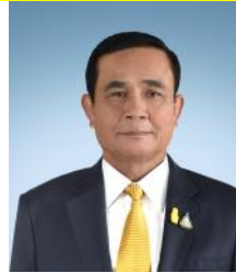
H.E. GENERAL (RET.) PRAYUT CHAN-O-CHA