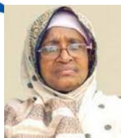
HON. MANJUJAN SUFIAN Minister for Labor and Employment (Bangladesh)