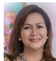
HON. SANDRA MONTANO Commissioner, Philippine Commission on Women (Philippines)