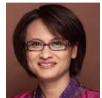
DIAN SISWARINI CEO, XL AXIATA (Indonesia)