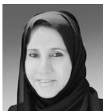
H.E. DR. MAITHA AL- SHAMSI Minister of State (UAE)