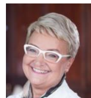
HON. HENRYKA BOCHNIARZ Former Minister of Trade (Poland)