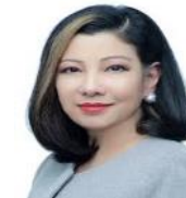
CHADATIP CHUTRAKUL CEO, Siam Piwat (Thailand)