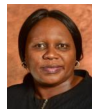
HON. NOMALUNGELO GINA Deputy Minister of Trade and Industry (South Africa)