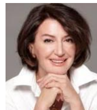
HON. ATIFETE JAHJAGA Former President, Kosovo