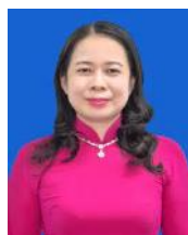
H.E. VO THI ANH XUAN Vice President Vietnam