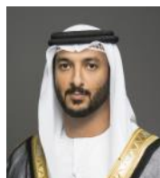
H.E. ABDULLA BIN TOUQ AL MARRI Minister of Economy (UAE)