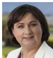
HON. ANNE RABBITTE Minister for Disability (Ireland)