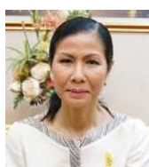
KOBKARN WATTANAVRANGKUL Former Minister of Tourism and Sports; Chair, Toshiba Thailand (Thailand)