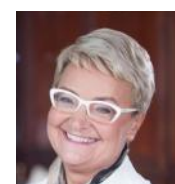
HENRYKA BOCHNIARZ Former Minister of Trade; Chair, Polish Pri- vate Employers Confed- eration (Poland)