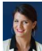
HON. MARLENE SCHIAPPA

FRANCE State Secretary for Gender Equality