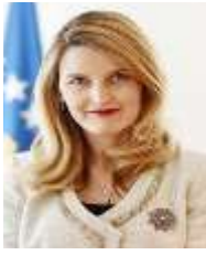
HON. DHURATA HOXHA Kosovo Minister for European Integration