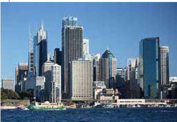
(top) Sydney's famous Opera House (bottom) The skyline of Sydney, the business capital of Australia

The Global Summit of Women looks forward to having its international participants become more acquainted with Australia's women leaders and the country's business community.