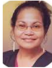
HON. FAUSTINA K. REHURER-MARUGG PALAU Minister of State