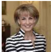
HON. MICHAELIA CASH

AUSTRALIA Minister for Jobs and Innovation