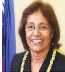
H.E. HILDA HEINE