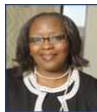
HON. ELIZABETH THABETHE SOUTH AFRICA Deputy Minister of Tourism