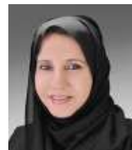
HON. MAITHA AL-SHAMSI UNITED ARAB EMIRATES Minister of State