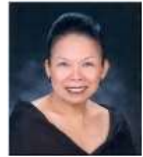
HON. PATRICIA LICUANAN PHILIPPINES Commissioner for Higher Education