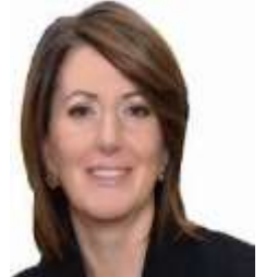
H.E. ATIFETE JAHJAGA