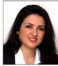
HON. HELENE DALLI MALTA Minister for European Affairs and Equality