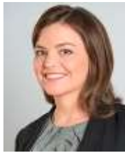
HON. JULIE ANNE GENTER NEW ZEALAND Minister of Women