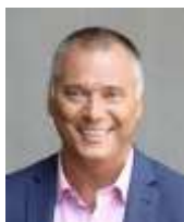
Stan Grant Presenter, Australian Broadcasting Channel (Australia)