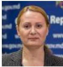
HON. STELA GRIGORAS MOLDOVA Minister of Labor, Social Protection and Family