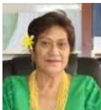
HON. FAIMALOTOA KIKA IEMAIMA STOWERS SAMOA Minister for Women's Affairs and Social Development