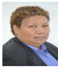
HON. FREDA TUKI SORIOCOMUA SOLOMON ISLANDS Minister for Women, Youth and Children