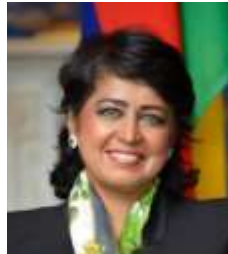
H.E. AMEENAH GURIB-FAKIM