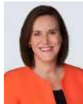
HON. KELLY O'DWYER

AUSTRALIA Minister for Jobs and Innovation