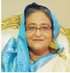
H.E. SHEIKH HASINA