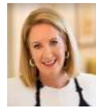
Elizabeth Broderick Special Rapporteur, UN Human Rights Council (Australia)