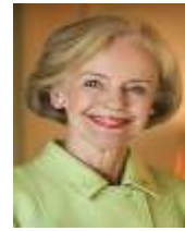
HON. DAME QUENTIN BRYCE

AUSTRALIA Minister for Women; Minister for Revenue