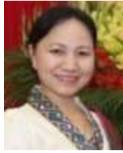
HON. INVALANH KEOBOUNPHANH Lao PDR Minister/ President, Lao Women's Union