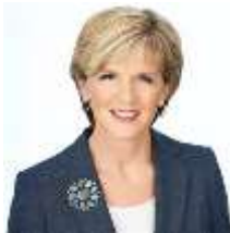
HON. JULIE BISHOP