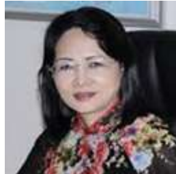
H.E. DANG THI NGOC THINH