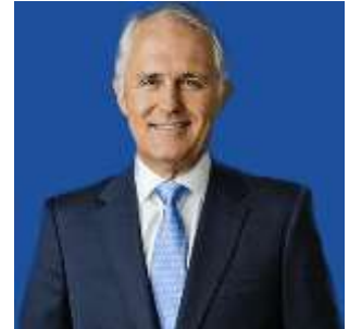
Australia's Prime Minister, Malcolm Turnbull

One of the leading economies in the Asia-Pacific region and the 12th largest economy in the world, Australia is the proud Host of the 2018 Global Summit of Women. Home to the world's oldest living culture, Australia is a place like no other. With spectacular landscapes and rich in natural resources, a stable government, open market and skilled workforce, Australia makes a compelling destination for doing business. Home to some of the world's largest companies, the economy is firmly planted as a hub to the fastest growing region in the world — the Indo-Pacific.